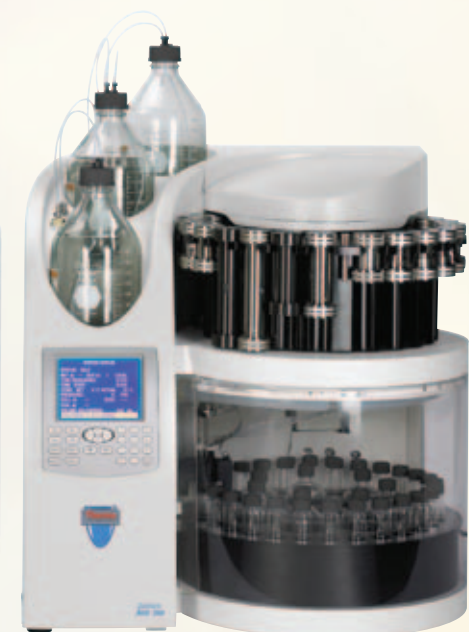
Dionex ASE 350